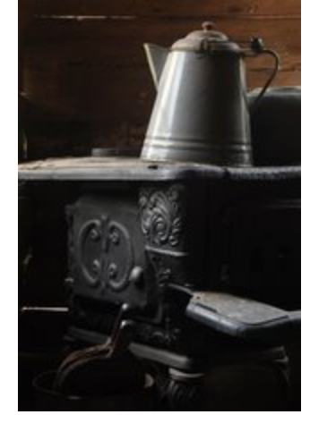
Clay Thurston of Knoxville, TN "The Good Ole Days" Photography, 19 x 25, $250