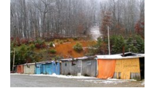
Amy Lee of Knoxville, TN "Clepsydra" Digital Print, 22 x 30, $200