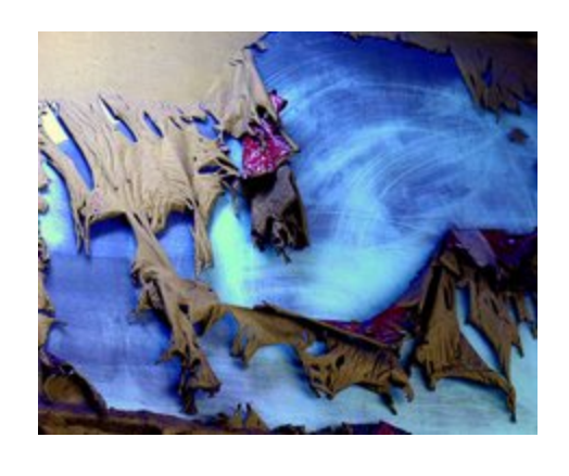
Tom McDaniel of Knoxville, TN "Window on Old City" Digital Photography, 27 x 41, $350