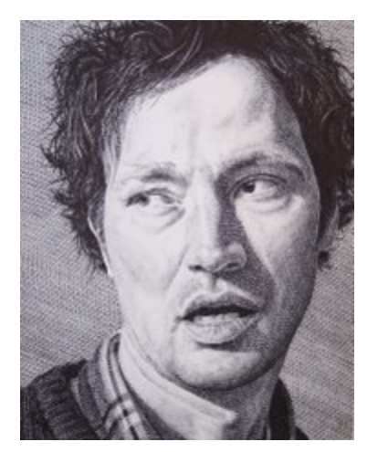
Carl Gombert of Maryville, TN "Battle of the Sexes" Rubber Stamp Monotype, 40 x 32, $1,600