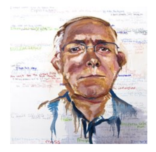
Stephanie Untz of Knoxville, TN "Clothes Pins" Oil on panel, 24 x 24, $600