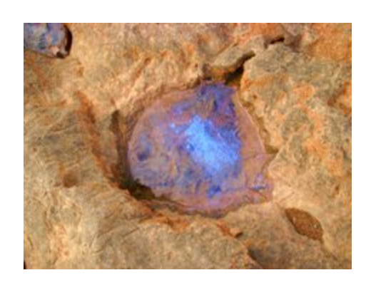
Alan Finch of Knoxville, TN "Frozen Fish #2" Digital Photography, 16 x 20, $110