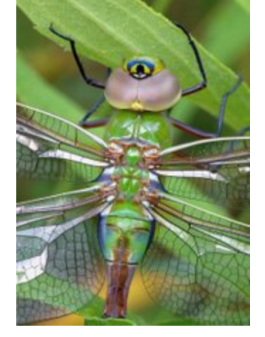
Clay Thurston of Knoxville, TN "Dragonfly" Photography, 19 x 25, $250