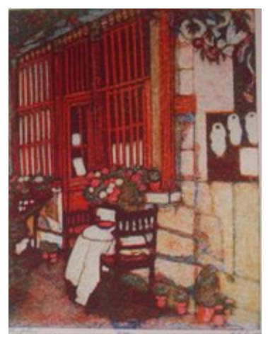
Nancy Kula of Gallatin, TN "Table for Two" Monotype - hand pulled print, 24 x 30, $525