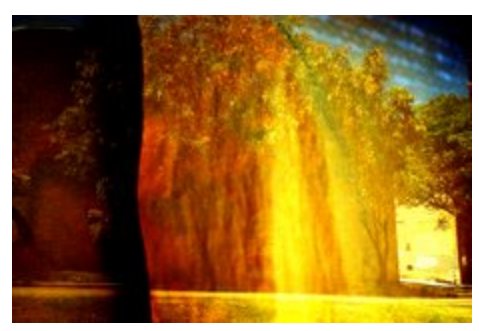
Tom McDaniel of Knoxville, TN "Passage" Digital Photography, 27 x 41, SOLD