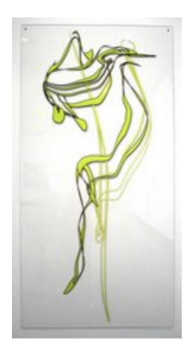
Amy Lee of Knoxville, TN "Woman Reflected" Vinyl decal on Plexiglas, 36 x 72, $350