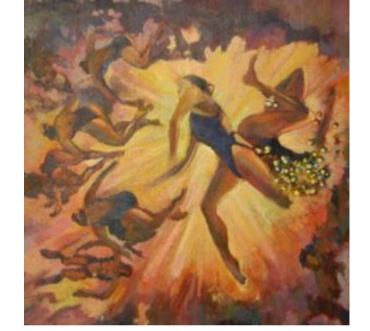
Victor Costantino of Knoxville, TN "Diving After Tiepolo" Oil on panel, 10 x 10, $700