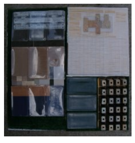
designthinking of Sevierville, TN "Grid #2" Mixed media, 48 x 48, $2,000