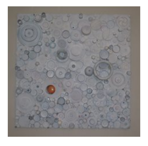
designthinking of Sevierville, TN "Please Recycle" Mixed media, 48 x 48, SOLD