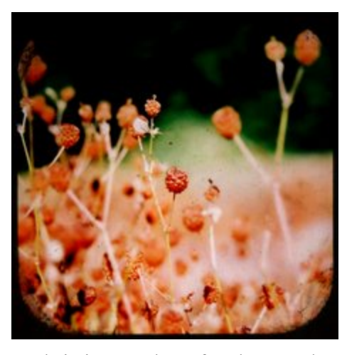
Christina Perdue of Helenwood, TN "When It's Over" Photography, 16 x 20, SOLD