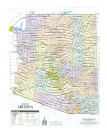
Nick DeFord of Knoxville, TN "Lost (Arizona)" Embroidery on map, 22 x 18, $600