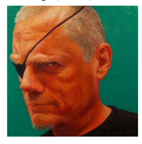
JUROR'S CITATION Carl Gombert of Maryville, TN "Jim (Alphabet Boy)" Oil over Collage, 36 x 36, $3,200